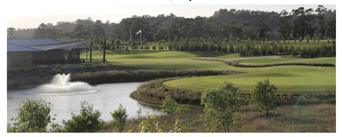
The 13th Probus Victoria Friendship Golf Day will be hosted by Croydon Park Probus Club

Format: 18 holes, 4 person Ambrose Tee Time: 8am shot gun start